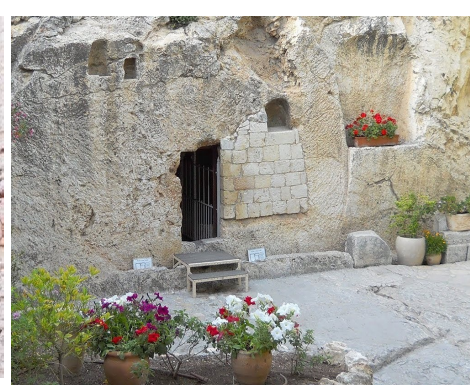
Garden of Gethsemane