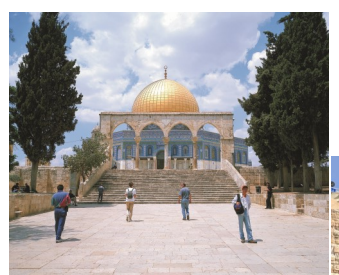
Al-Aqsa Mosque at the Temple Mount