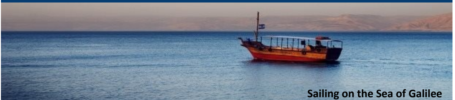
Sailing on the Sea of Galilee