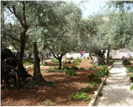
Garden of Gethsemane