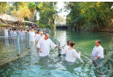
Yardenit Jordan River Baptismal Site